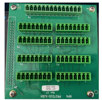
Figure 1: Previous version of PMX-4EX-SA-TBS

Effective immediately, the board's color will transition from green to red, as seen in these photos.